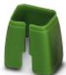
Color marking for patch cable, green

Color-coding - FL PATCH CCODE GN - 2891796