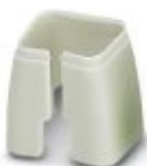
Color marking for patch cable, gray

Color-coding - FL PATCH CCODE GY - 2891699