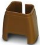
Color marking for patch cable, brown

Color-coding - FL PATCH CCODE BN - 2891495