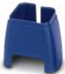
Color marking for patch cable, blue

Color-coding - FL PATCH CCODE BU - 2891291