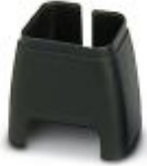
Color marking for patch cable, black

Color-coding - FL PATCH CCODE BK - 2891194