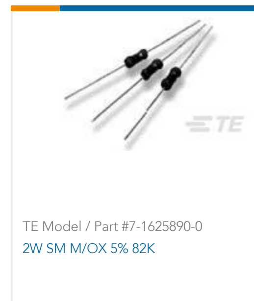
TE Model / Part #7-1625890-0 2W SM M/OX 5% 82K