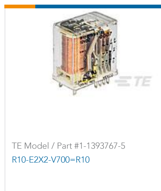
TE Model / Part #1-1393767-5 R10-E2X2-V700=R10