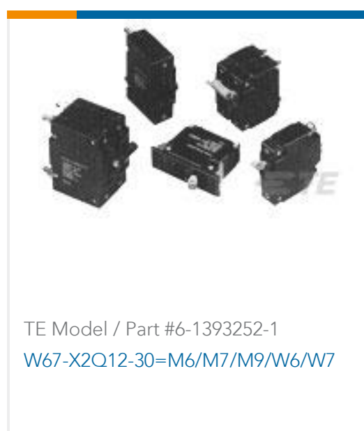
TE Model / Part #6-1393252-1 W67-X2Q12-30=M6/M7/M9/W6/W7