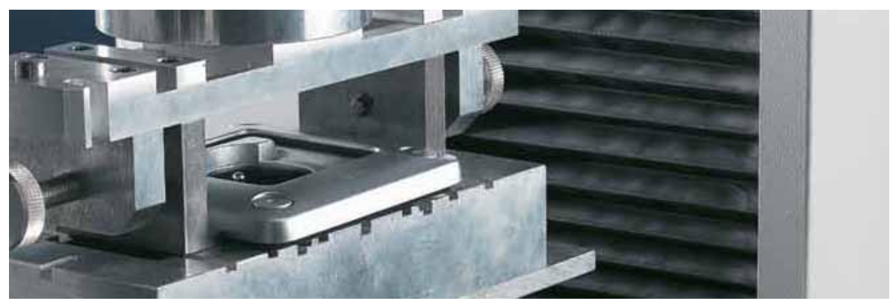
IK 10: MAXIMUM PULL-OFF RESISTANCE Rounded plate shape to prevent a firm grasp