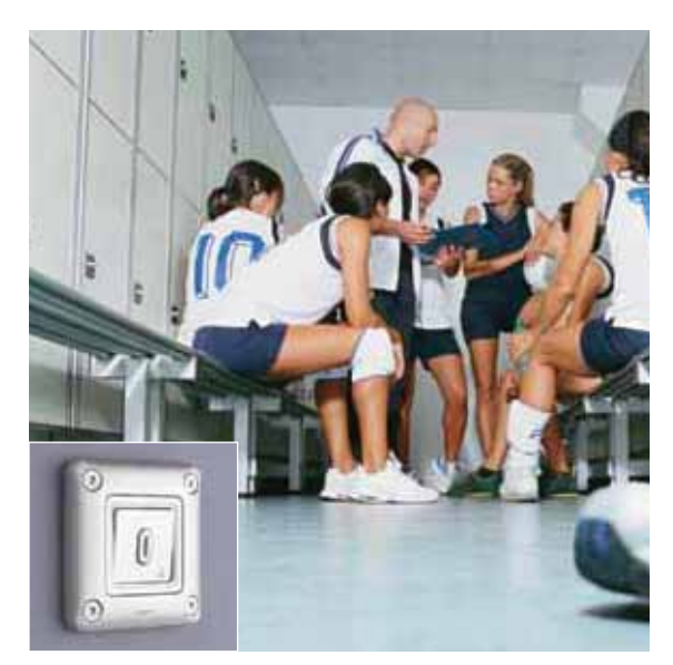
SPORTS FACILITIES | Illuminated pushbutton