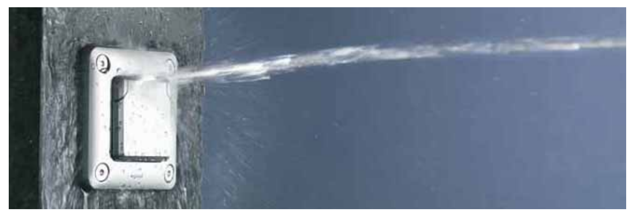
IP 55: GUARANTEED WEATHERPROOF On the main functions required for outdoor installations