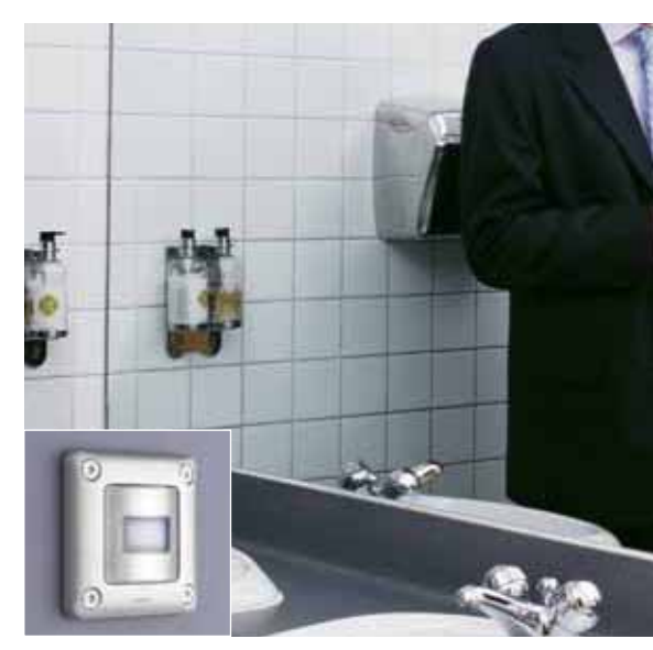
PUBLIC WASHROOMS | Automatic switch