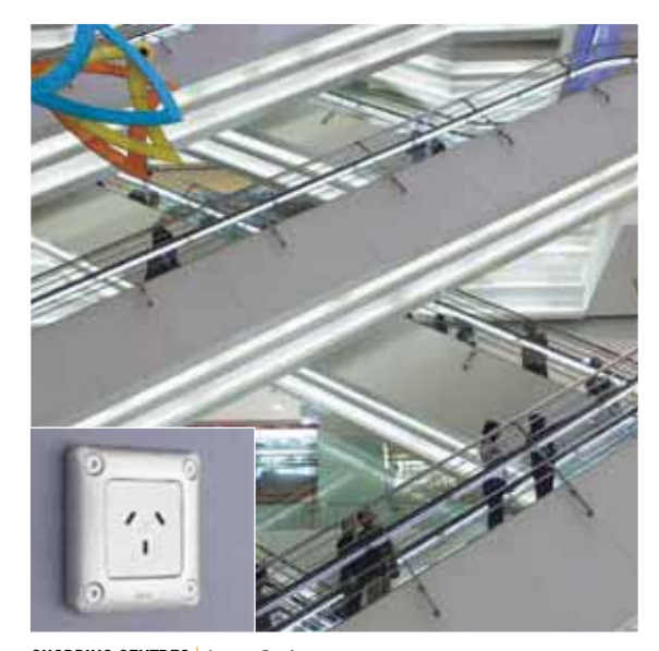
SHOPPING CENTRES Arteor Socket