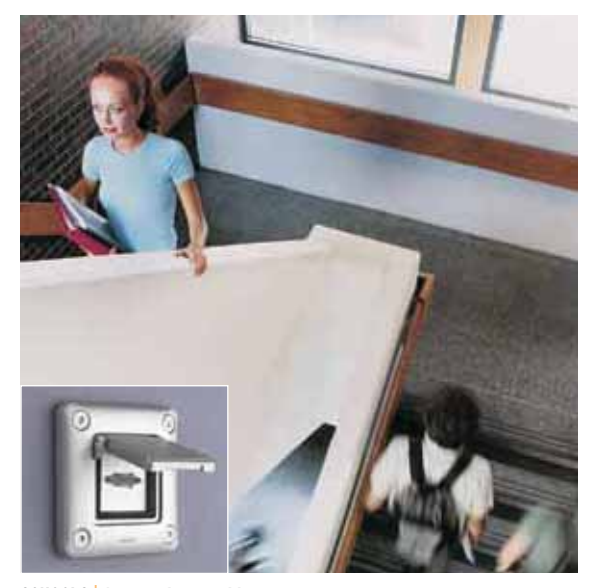
SCHOOLS Arteor adaptor with cover