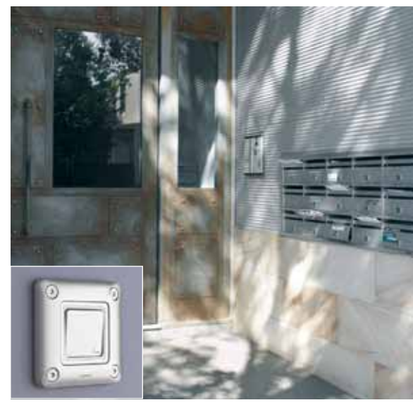
OUTDOOR AREAS | Weatherproof switch