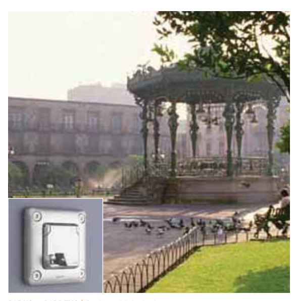
PARKS & GARDENS | Socket with locked cover