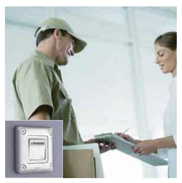
OFFICES | Pushbutton with label-holder