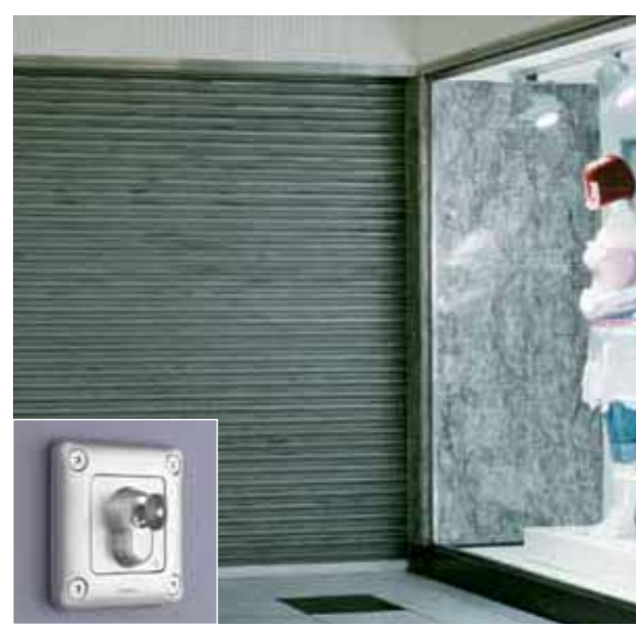
SHOP FRONTS | Keyswitch