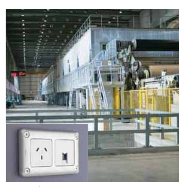
WAREHOUSES Arteor Socket + RJ 45 network socket