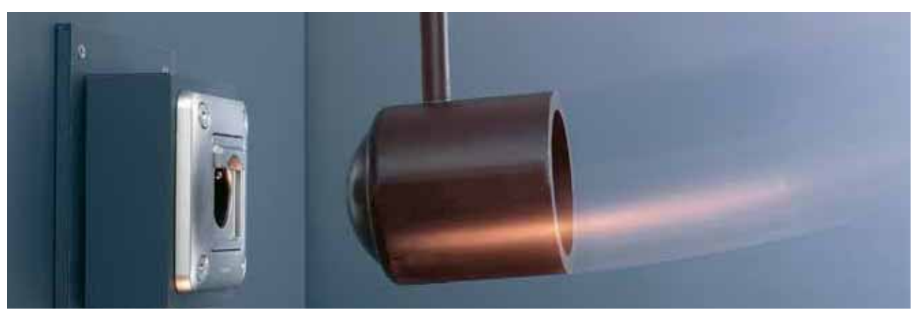
IK 10: MAXIMUM IMPACT RESISTANCE All Soliroc products can withstand impacts of 20 joules

All Soliroc™ products have successfully undergone severe testing to ensure we can offer you maximum security.