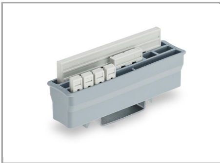
Collective carrier for TOPJOB® S jumpers