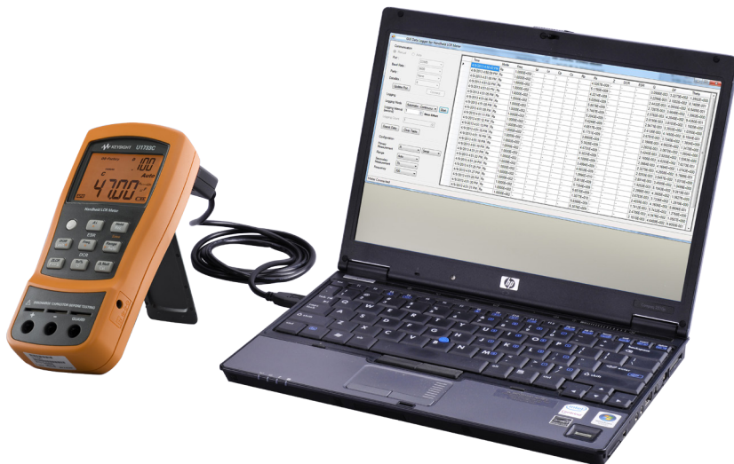
Figure 1. Automate the recording of continuous readings when you hook the U1731C/U1732C/U1733C to a PC

The handheld LCR meters allows you to test various component types, including secondary components of Dissipation Factor (D), Quality Factor (Q), and Angle Indication of Impedance ( \theta ). This new handheld series also includes other functions that result in a more detailed component analysis. For example, the built-in Equivalent Series Resistance (ESR) function helps you better understand the inherent resistance behavior typically found in capacitors across selected frequencies. DCR is a built-in DC resistance measurement that eliminates the use of a separate digital multimeter (DMM) for component test.