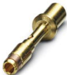
Crimp contact, turned, Single contact, contact diameter: 2 mm, crimp range: 1 mm 2 ... 2.5 mm 2

Please be informed that the data shown in this PDF Document is generated from our Online Catalog. Please find the complete data in the user's documentation. Our General Terms of Use for Downloads are valid ( http://phoenixcontact.com/download )