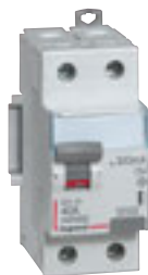
4 115 25

residual current devices 16 A to 100 A - AC, A and Hpi types