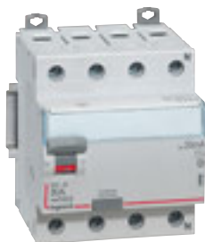
4 117 05