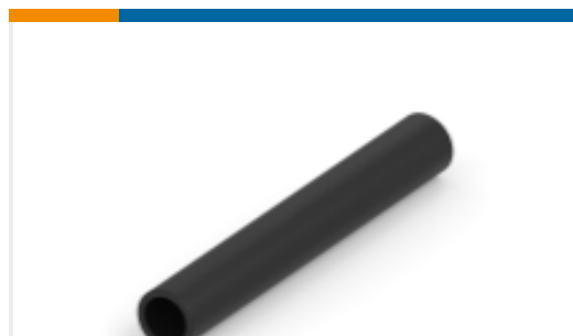
TE Part #0316676003 LSTT-R-3.2-0