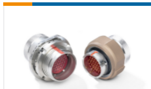
TE Part #ZPF000000000024722 901-24 R 12-0 PN