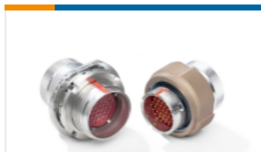
TE Part #ZPF000000000004966 901-24 R 7-93 PN