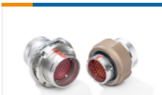
TE Part #ZPF000000000024741 901-24 R 61-0 PN