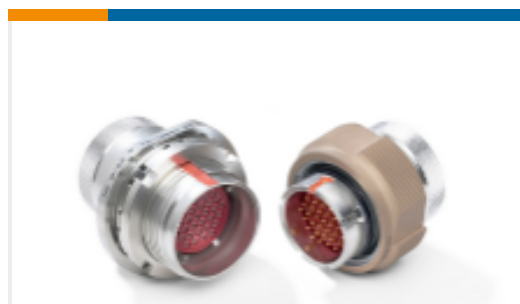
TE Part #ZPF000000000103699 901-24 R 61-5 PN-T2