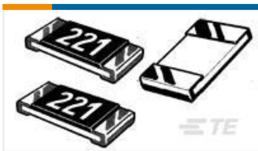
TE Part #4-2176070-1 3521 470R 1% 2W