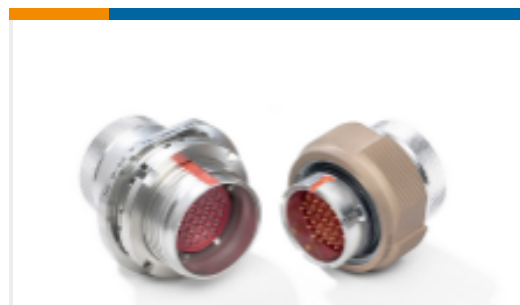
TE Part #ZPF000000000106250 901-20 R 121-903 SN