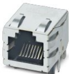
RJ45 socket insert, type: RJ45, degree of protection: IP20, number of positions: 8, 10 Gbps, connection method: Solder connection

Please be informed that the data shown in this PDF Document is generated from our Online Catalog. Please find the complete data in the user's documentation. Our General Terms of Use for Downloads are valid ( http://phoenixcontact.com/download )