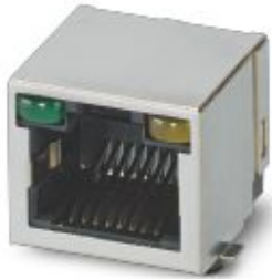
RJ45 jack insert, degree of protection: IP20, 10 Gbps, connection method: solder connection, MSL 1

Please be informed that the data shown in this PDF Document is generated from our Online Catalog. Please find the complete data in the user's documentation. Our General Terms of Use for Downloads are valid ( http://phoenixcontact.com/download )