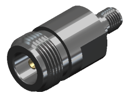
ISOMETRIC VIEW FULL SCALE