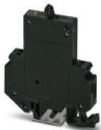
Thermomagnetic circuit breaker, 1-pos., fast blow, 1 N/C contact, with universal foot for mounting on NS 32 or NS 35

Please be informed that the data shown in this PDF Document is generated from our Online Catalog. Please find the complete data in the user's documentation. Our General Terms of Use for Downloads are valid ( http://phoenixcontact.com/download )