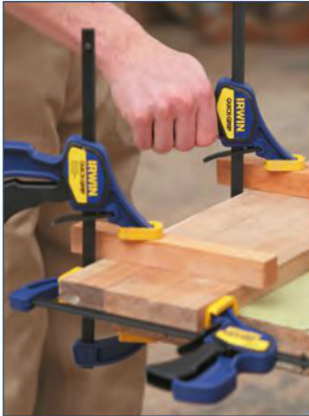
182578 Mini Replacement Pads

Quick-release trigger for fast and easy positioning Pistol Grip Design enhance comfort and ease of use Removable soft pads