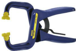
182579 Handi Clamp Replacement Pads