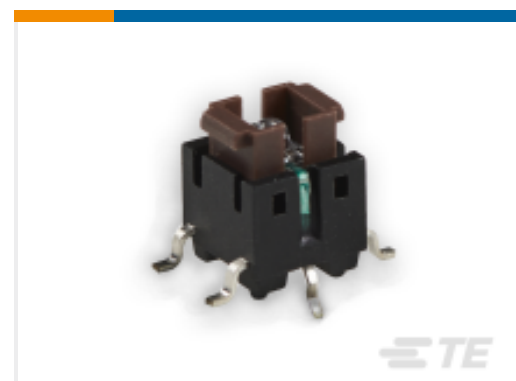
TE Part #2-2213819-7 6X6 ILL TACT SMT 160GF HI YELLOW GREEN