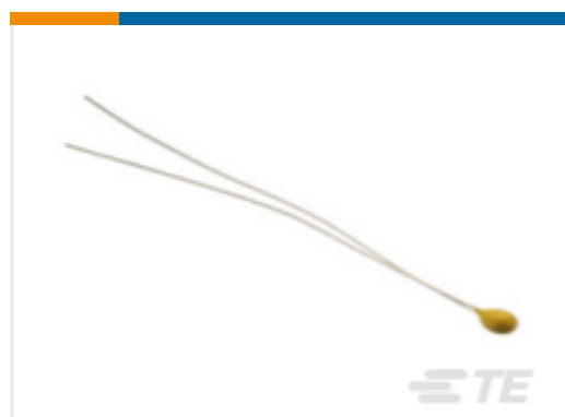
TE Part #GA10K3A1AM DISCRETE 10K, +/-0.05C FROM 32C to 44C