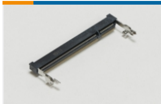
SO DIMM Sockets(39)