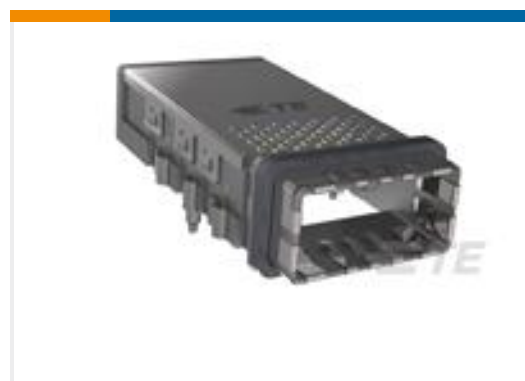
TE Part #2149152-1 Receptacle Assembly