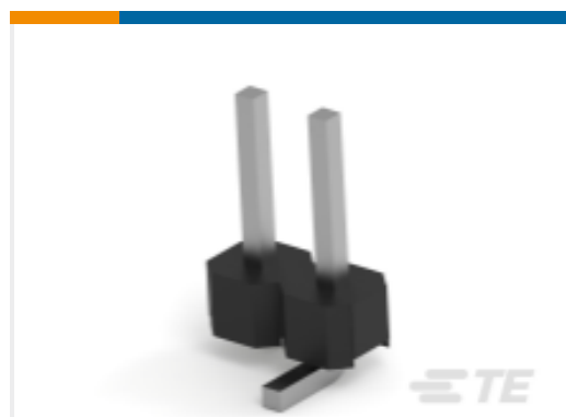
TE Part #2842102-2 2P, 2MM, BRK HDR, SRVT, SMD, 0.1AU, TR W/CAP