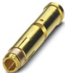
Crimp contact, turned, contact diameter: 2 mm, crimp range: 2.5 mm 2 ... 4 mm 2

Please be informed that the data shown in this PDF Document is generated from our Online Catalog. Please find the complete data in the user's documentation. Our General Terms of Use for Downloads are valid ( http://phoenixcontact.com/download )