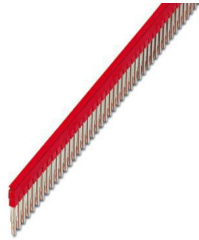
Plug-in bridge, pitch: 6.2 mm, number of positions: 50, color: red

Please be informed that the data shown in this PDF document is generated from our online catalog. Please find the complete data in the user documentation. Our general terms of use for downloads are valid.