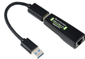
USB 3.2 Gen1 And Gigabit Ethernet