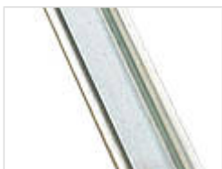
DIN rail acc. to DIN EN 60715 TH 15