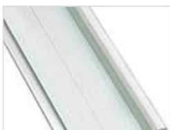
DIN rail acc. to DIN EN 60715 TH 35

For EM/ET 213, EM/ET 215-217, EM/ET 227, B 1408.., B 1413..