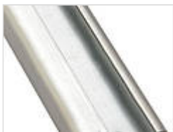
DIN rail acc. to DIN EN 60715 G 32

For EM/ET 213, EM/ET 215-217, EM/ET 227, B 1408.., B 1413..