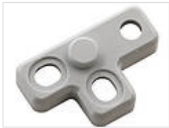
Wall brackets, screw-on at rear