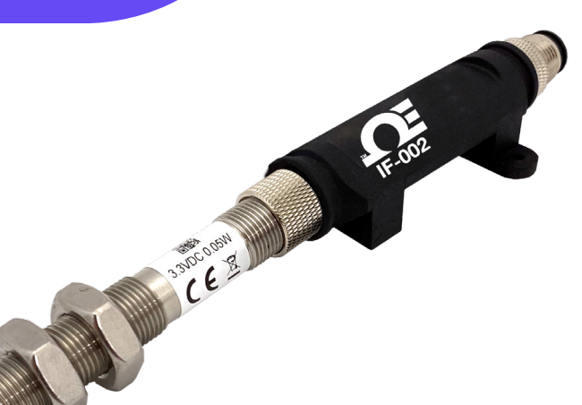
Probe not included