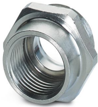
M12 female connector, front mounting SMD with M14 screw fastening

https://www.phoenixcontact.com/us/products/1412079