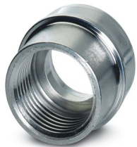
Housing screw connection, Socket, M12, Front mounting, Alternative product in accordance with RoHS II without Exemption 6c (Pb < 0.1 %) item no.: 1238973

https://www.phoenixcontact.com/us/products/1412081