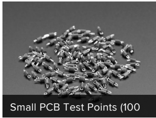
Small PCB Test Points (100)