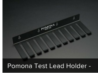
Pomona Test Lead Holder -