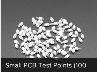
Small PCB Test Points (100)