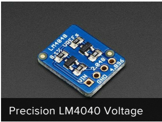
Precision LM4040 Voltage