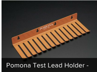
Pomona Test Lead Holder -