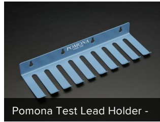
Pomona Test Lead Holder -