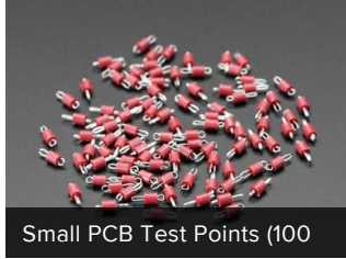
Small PCB Test Points (100)