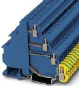
Sensor/actuator terminal block, connection method: Screw connection, cross section: 0.2 mm 2 - 4 mm 2 , AWG: 24 - 12, width: 6.2 mm, color: blue, mounting type: NS 35/7,5, NS 35/15

Please be informed that the data shown in this PDF Document is generated from our Online Catalog. Please find the complete data in the user's documentation. Our General Terms of Use for Downloads are valid ( http://phoenixcontact.com/download )