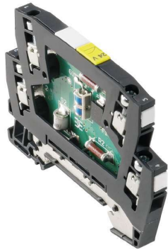
Similar to illustration