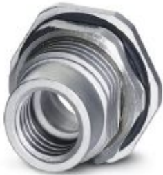
M8 socket, rear mounting

Please be informed that the data shown in this PDF Document is generated from our Online Catalog. Please find the complete data in the user's documentation. Our General Terms of Use for Downloads are valid ( http://phoenixcontact.com/download )