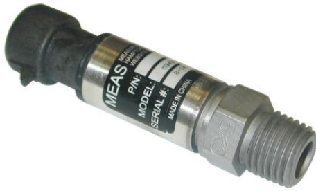
Shown with Packard Connector