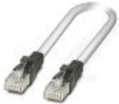
Patch cable, CAT5, assembled, 0.5 m

Patch cable - FL CAT5 PATCH 0,5 - 2832263