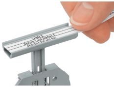
Group marker carrier (2009-163) for marking strips (2009-110)