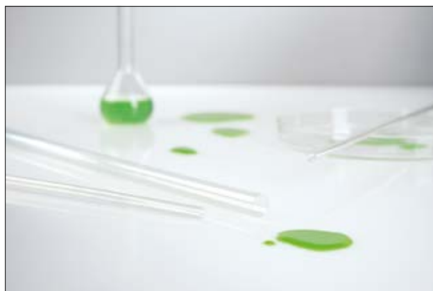
TFE is available in either 2:1 or 4:1 shrink ratios.