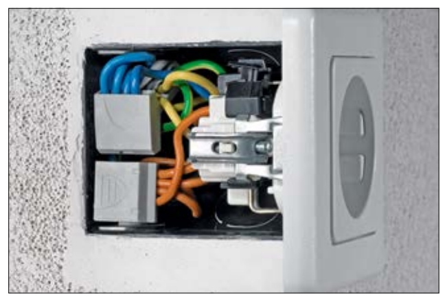
The compact design of HelaCon Easy fits perfectly in tight spaces.