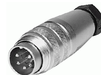
View represents all available contact positions. 08.06.2014