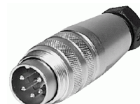
View represents all available contact positions.