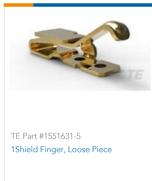
TE Part #1551631-5 1Shield Finger, Loose Piece