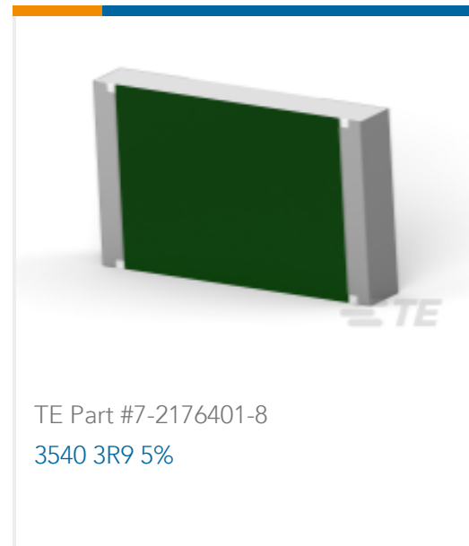
TE Part #7-2176401-8 3540 3R9 5%