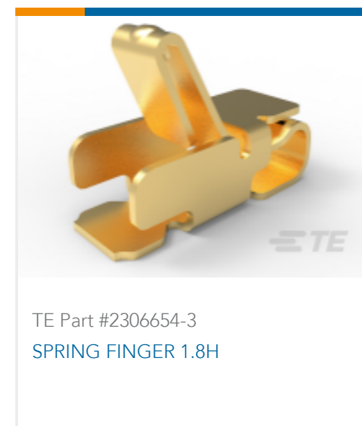
TE Part #2306654-3 SPRING FINGER 1.8H