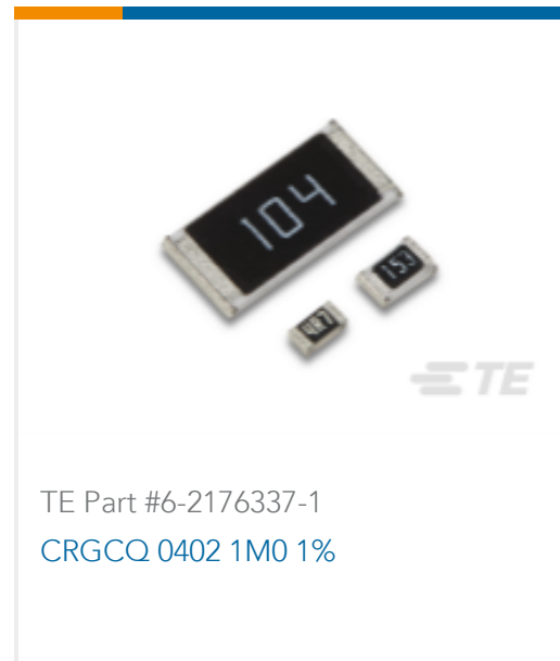
TE Part #6-2176337-1 CRGCQ 0402 1M0 1%