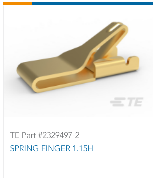
TE Part #2329497-2 SPRING FINGER 1.15H