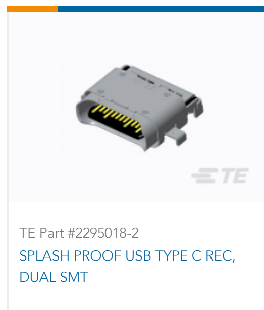
TE Part #2295018-2 SPLASH PROOF USB TYPE C REC, DUAL SMT