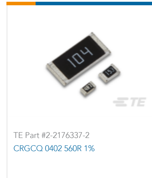
TE Part #2-2176337-2 CRGCQ 0402 560R 1%