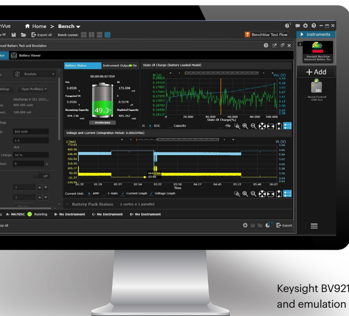
Keysight BV9211B battery test and emulation software

Note: The N6705C and N6700C support more than 50 modules that you can mix and match for various testing use cases. Battery emulation is only one of many supported use cases. The E36731A, in contrast, is optimized specifically for battery emulation and profiling.