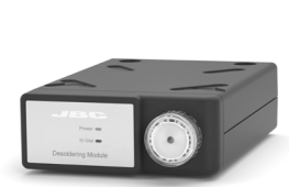
Electric Desoldering Module .....1 unit