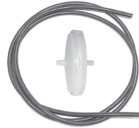
Suction Filter .....1 unit Ref. 0821830