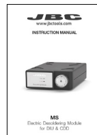
Manual .....1 unit Ref. 0027989