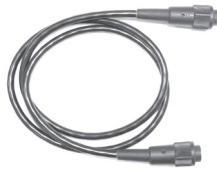
Module Cable connector .....1 unit Ref. 0026830