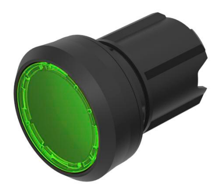
Attention: The preview is based on a sample product. This can differ from your current configuration.