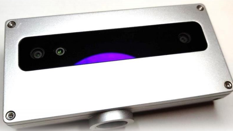
Figure 1 – OAK-D CM4 PoE