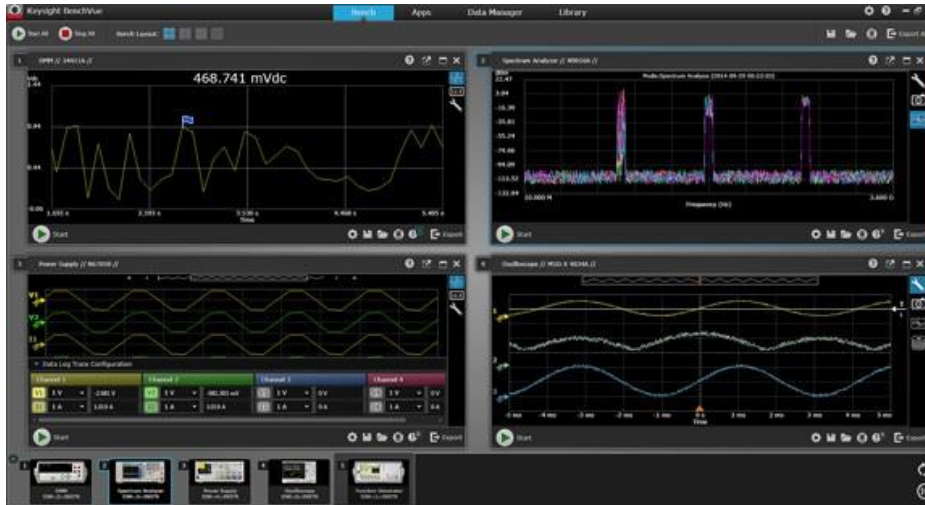
Figure 1. See your measurements across instruments in one place to quickly correlate measurement activities and obtain actionable insights.

With the companion BenchVue Mobile app, monitor and respond to long-running tests from anywhere. Download BenchVue software at no cost today www.keysight.com/find/benchvue