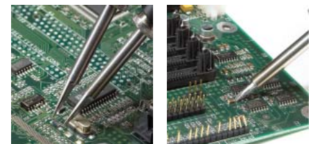
Precision Tweezers rework SMD components with fine dimension to large blade geometries, while the Soldering Tip hand-piece has exceptional power for production soldering.