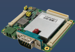
Low speed carrier board