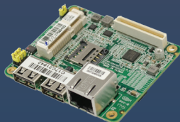
High speed carrier board (limited support)