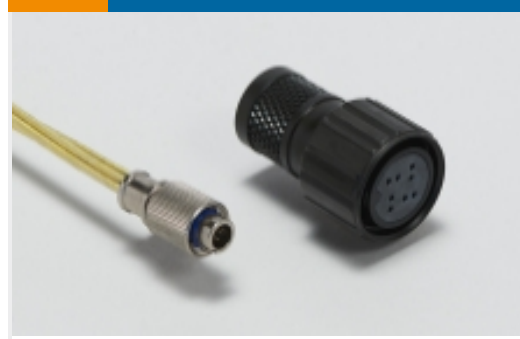
Standard Circular Connectors(76)