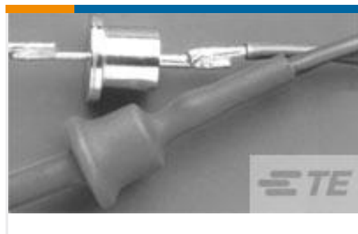
TE Part #5677572005 RNF-3000-6/2-0-STK