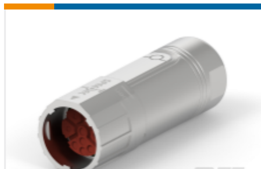
TE Part #BSA082F32590100000 923 PLUG, SPEEDTEC