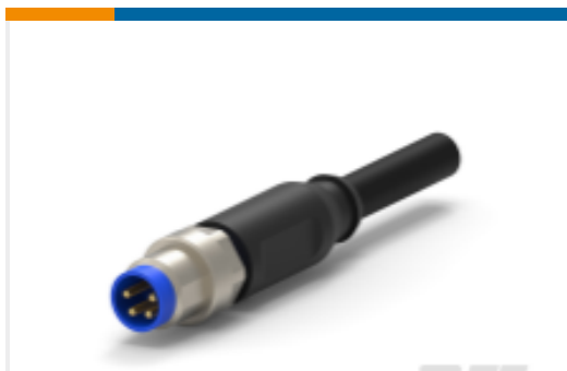
TE Part #1-2273002-1 M8 MALE STRAIGHT PIGTAIL