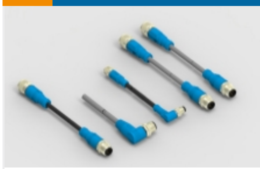
M8/M12 Cable Assemblies(135)