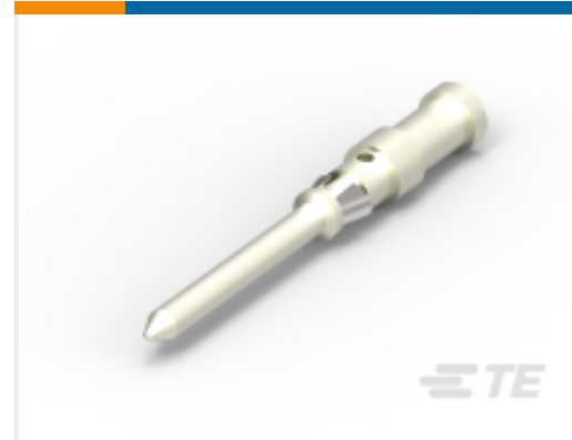
TE Model / Part # T2020001010-000 CDM-1.0