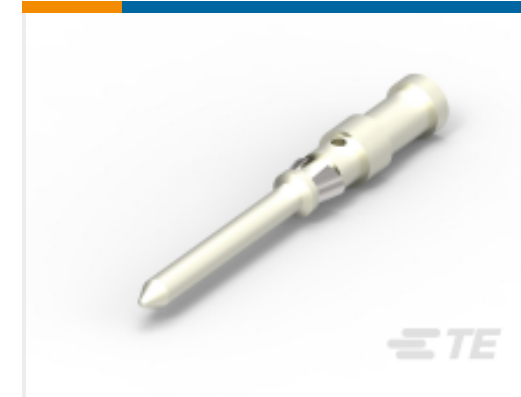
TE Model / Part # T2020001025-000 CDM-2.5