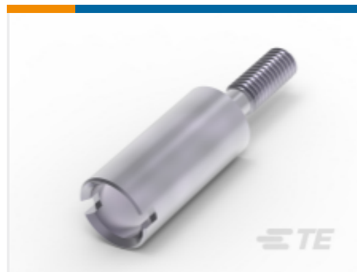
TE Model / Part # T0931106527-000 CODING-PIN-M3-LTF