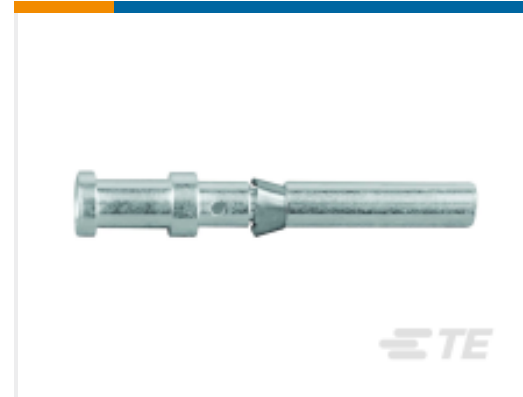
TE Model / Part # T2020002025-000 CDF-2.5