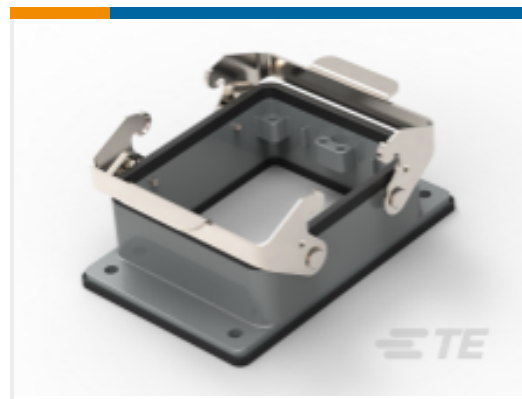
TE Model / Part # T1410322000-000 H32B-AG