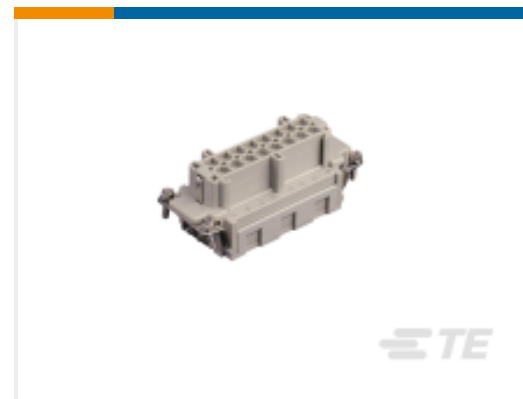
TE Model / Part # T2040163201-000 HE-016-FS