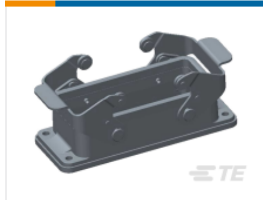
TE Model / Part # T1410161000-000 H116B-AGS