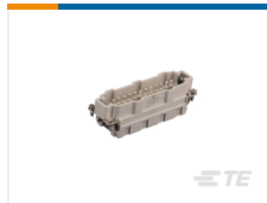
TE Model / Part # T2040243101-000 HE-024-MS