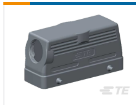
TE Model / Part # T1210240121-000 H24B-TS-PG21