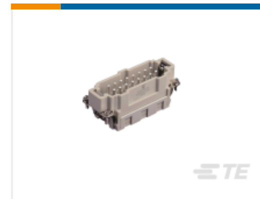
TE Model / Part # T2040163101-000 HE-016-MS