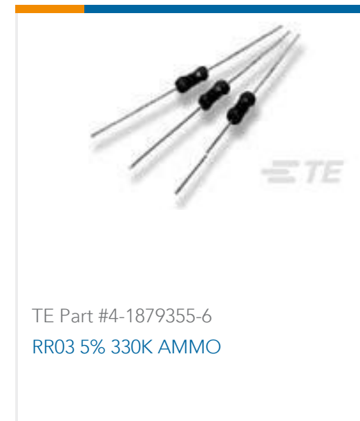
TE Part #4-1879355-6 RR03 5% 330K AMMO