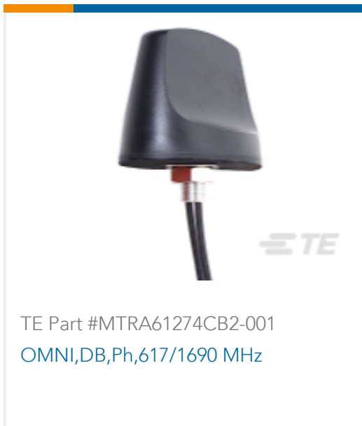
TE Part #MTRA61274CB2-001 OMNI,DB,Ph,617/1690 MHz