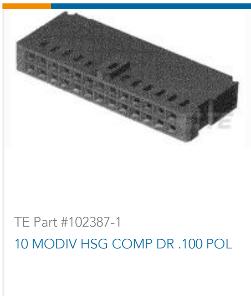
TE Part #102387-1 10 MODIV HSG COMP DR .100 POL