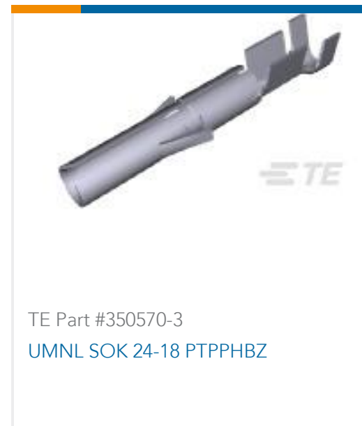
TE Part #350570-3 UMNL SOK 24-18 PTPPHBZ