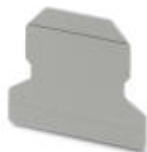
Partition plate, length: 56 mm, width: 1.5 mm, height: 45.7 mm, color: gray