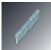
Fixed bridge, number of positions: 16, color: silver