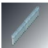
Fixed bridge, pitch: 5 mm, number of positions: 20, color: silver