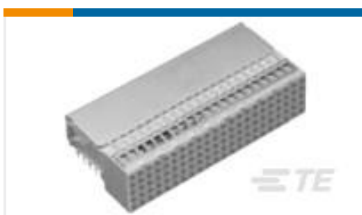
TE Part #352171-1 Z-PACK/B F-HDR. 95P