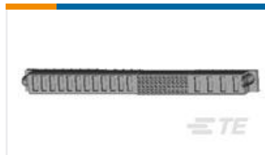
TE Part #6450863-5 MBXLE VERT RCPT 7ACP