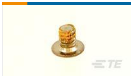
TE Part #1410946-1 MULTI-GIG SOC. CAP SCREW, CUSTOMIZED HDW