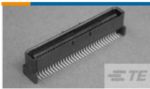
TE Part #5120527-1 1FHP,64,30A/S,S,N,S10, 12,13,15