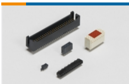
Board-to-Board Headers & Receptacles(67)