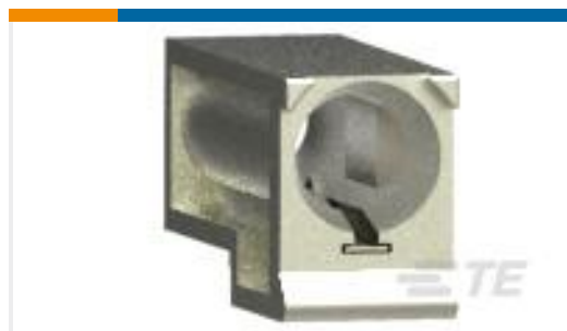
TE Part #1-1469492-7 MULTIGIG RT 9MM GUIDE