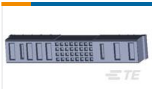
TE Part #1-6450869-4 V/R 2ACP+1LP+32S+3HDP+1LP+1P/ESD 270 DEG