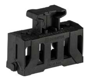
ESO 10.3x38 Fuse Inserter/Extractor with Cover Function for 10.3x38 mm Fuses in Clips, Patent Pending