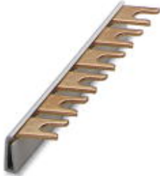
Wiring bridge for modules with connecting pitch 17.5 mm, 1-phase, 3-pos.

Please be informed that the data shown in this PDF Document is generated from our Online Catalog. Please find the complete data in the user's documentation. Our General Terms of Use for Downloads are valid ( http://download.phoenixcontact.com )