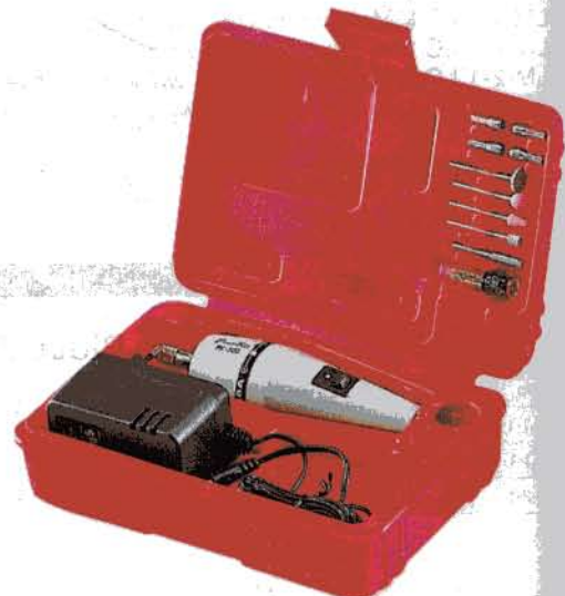
220V-240V SAA type