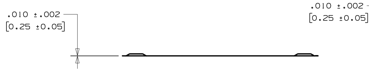
SECTION A - A SCALE 1:1