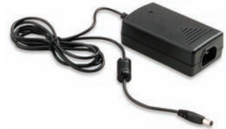
U1780A Power adapter and cord (according to country)