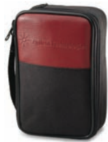
U1174A Soft carrying case