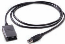
U5481A IR-to-USB cable