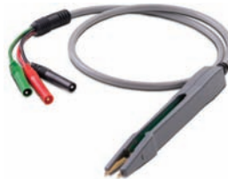
U1782A SMD tweezers