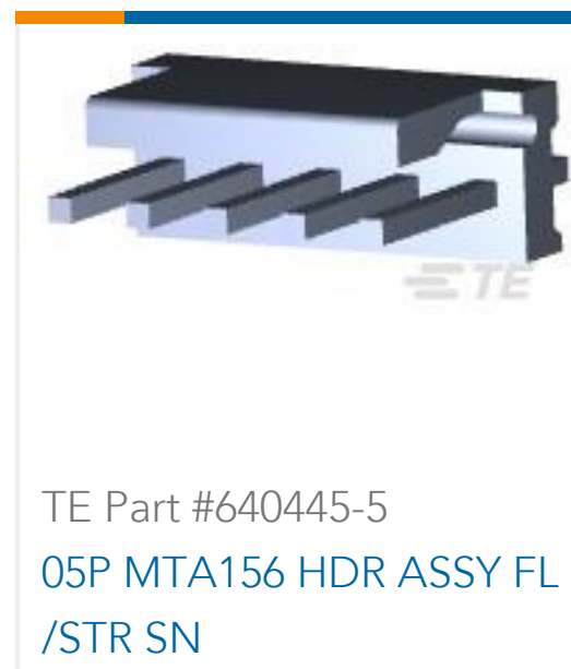
TE Part #640445-5 05P MTA156 HDR ASSY FL /STR SN