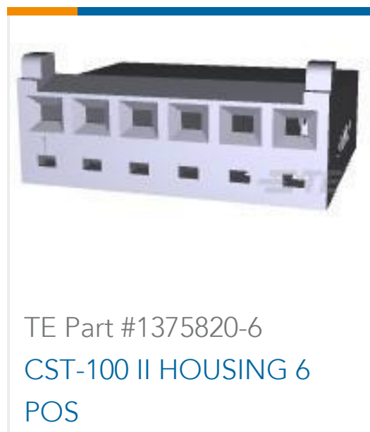
TE Part #1375820-6 CST-100 II HOUSING 6 POS