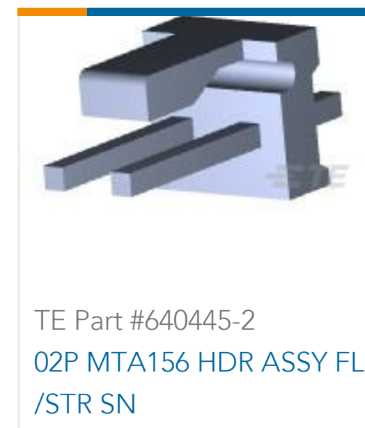
TE Part #640445-2 02P MTA156 HDR ASSY FL /STR SN