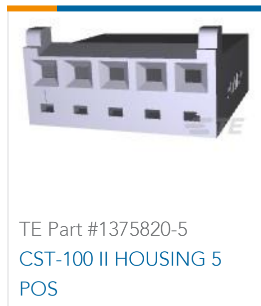
TE Part #1375820-5 CST-100 II HOUSING 5 POS