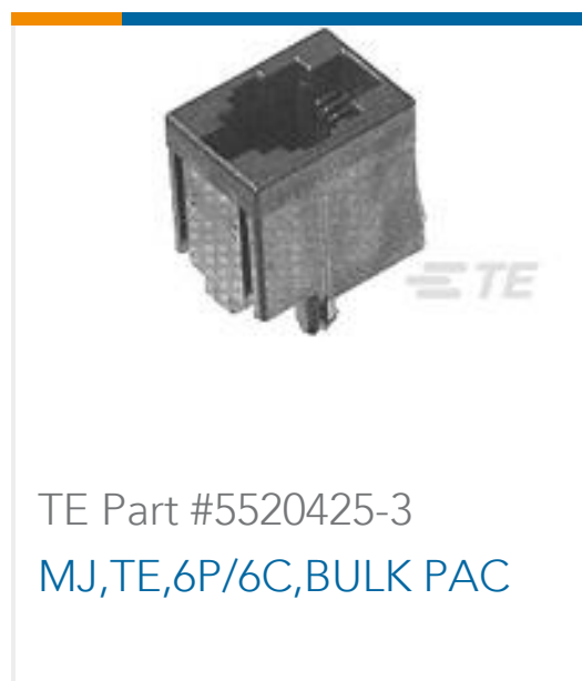
TE Part #5520425-3 MJ,TE,6P/6C,BULK PAC