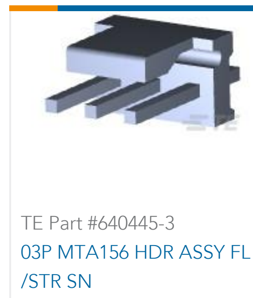
TE Part #640445-3 03P MTA156 HDR ASSY FL /STR SN